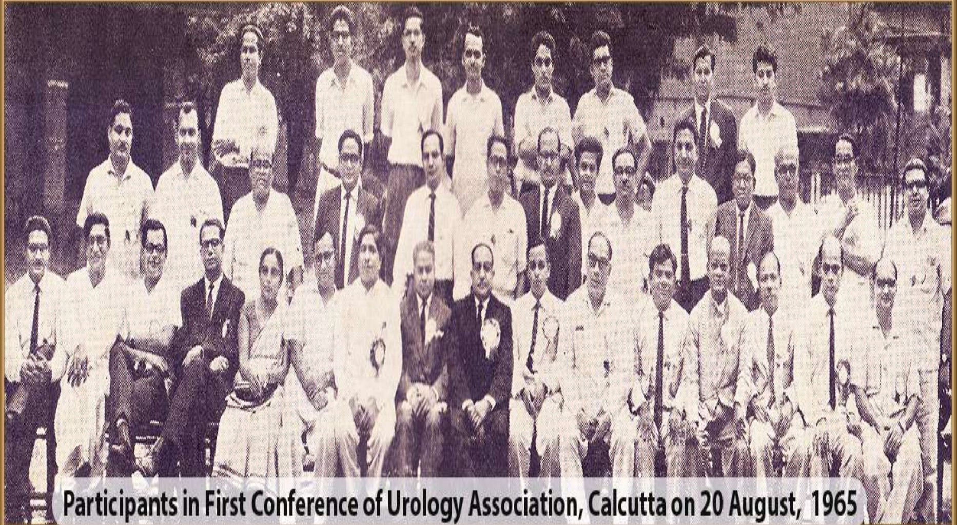
Participants in First Conference of Urology Association, Calcutta on 20 August, 1965